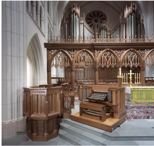
St. Martin's Episcopal Church