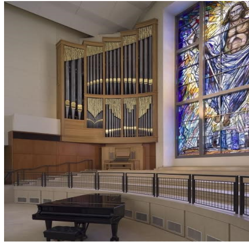
Co-Cathedral of the Sacred Heart