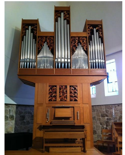
Episcopal Church of the Epiphany